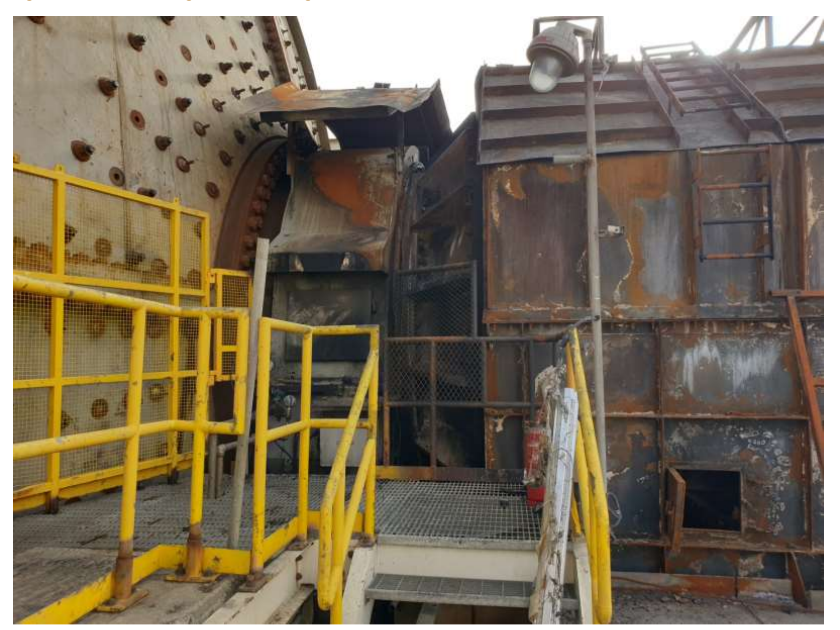
Figure 3: SAG mill discharge trunnion bearing and trommel

Kinross Gold Corporation 25 York Street, 17<sup>th</sup> Floor Toronto, ON Canada M5J 2V5