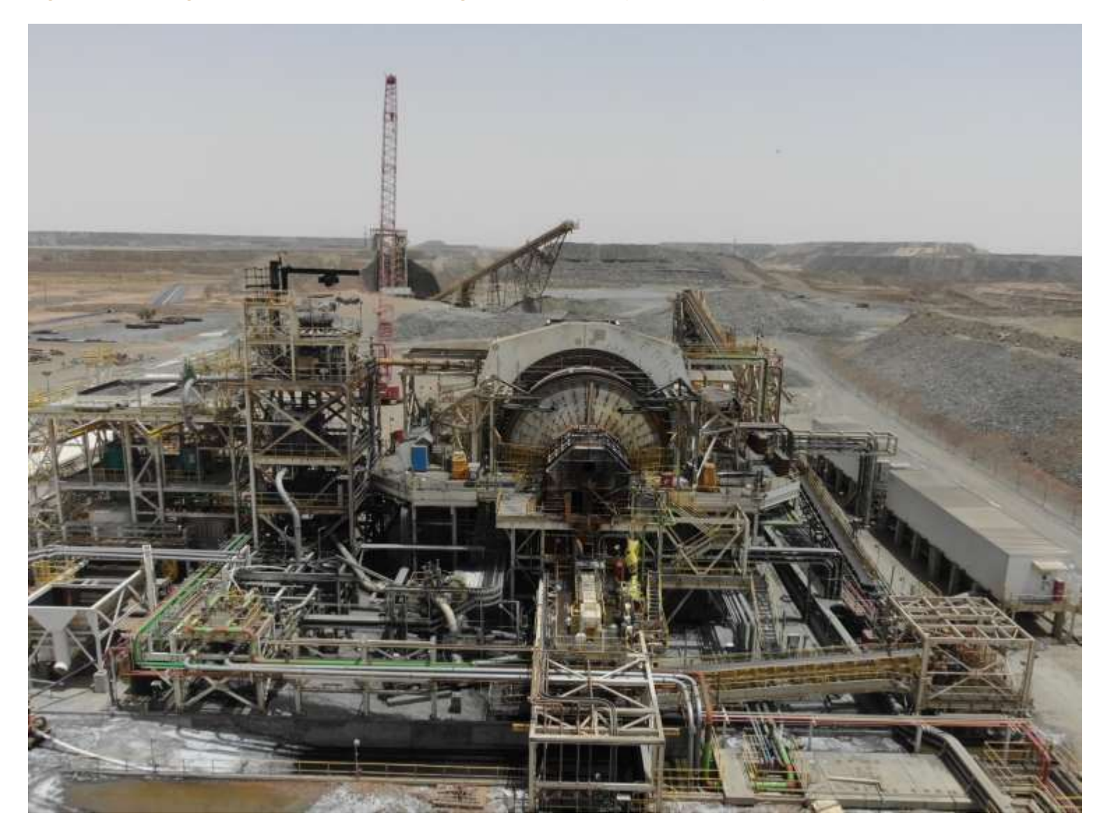
Figure 1: Discharge end of the SAG mill showing trommel screen (under its cover)